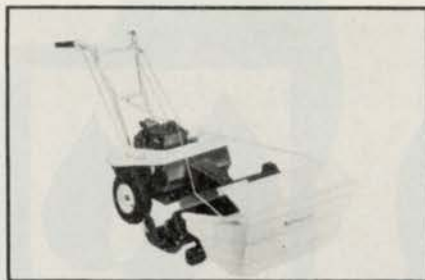
Circle No. 190 on Reader Inquiry Card

An out-front reel mower, the Model 30FTN, is National's latest turf maintenance offering. Individual wheel clutches located at the hand grips, adjustable handlebars, and hand-operated height adjustment are highlighted on this mower. Front caster wheels and pneumatic turf tires add to its man-