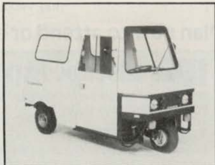
Circle No. 192 on Reader Inquiry Card

Both vehicles come with headlights, turn signals, stoplight/flashers, and hydraulic brakes on all wheels.