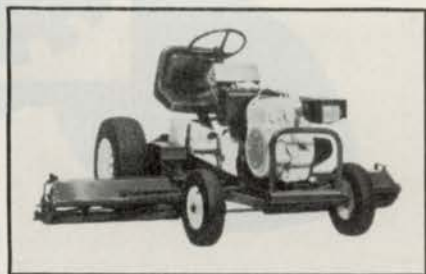
Circle No. 191 on Reader Inquiry Card

With either engine-equipped Model 84, five or six-bladed reels are available, bushing or Timken rollers, and a high speed reel kit.