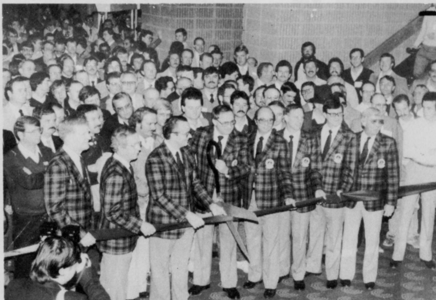
Throng awaits to tour the trade show floor.