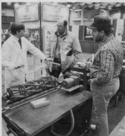
Learning what's new—a major part of the GCSAA show.

"Monday (the traffic) was unbelievable," he said. "Golf has been at a peak the last three years and probably next year, too. The economy is better and renovation is being done. Budgets can support improving irrigation systems."