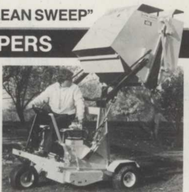
MODEL 48HL TURF SWEEPER

OLATHE MANUFACTURING, INC. 100 INDUSTRIAL PARKWAY, INDUSTRIAL AIRPORT, KS 66031