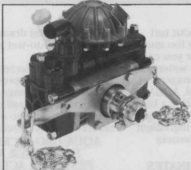
Medium pressure diaphragm pumps, to 580 psi, with outputs to 13 gpm.