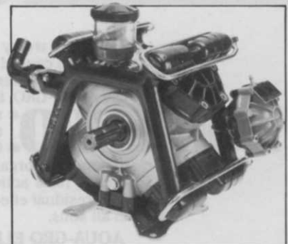
High pressure diaphragm pumps, to 850 psi, with outputs to 50 gpm.