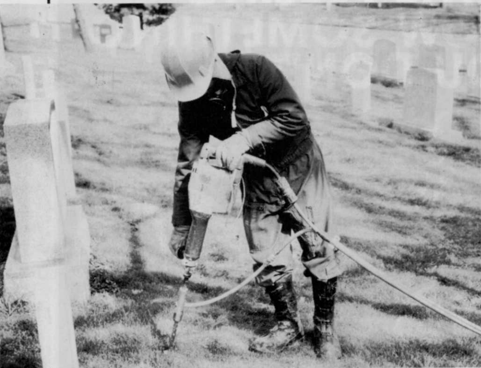
A crewman feeds one of the 9,000 trees on the cemetery grounds.

Lancaster Landscapes of Virginia holds the cemetery's mowing contract on its mainly bluegrass/fescue turf. According to Dihle, the company uses largely Gravely, Heckendorn and Jacobsen rotary mowers, cutting an average height of 2.5 to 3 inches.