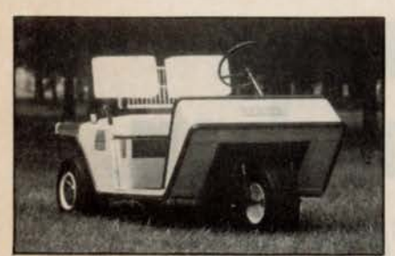
New golf car designs, see page 22.