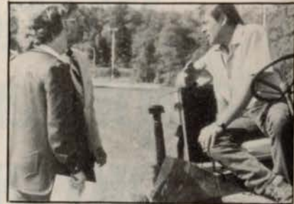
Carbide's woodland home, see page 42.