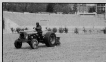
Duke University's landscape program, see page 64.