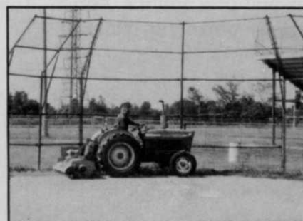
Detroit area school district controls costs, see page 70.