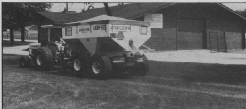
Efficient soccer field management, see page 24