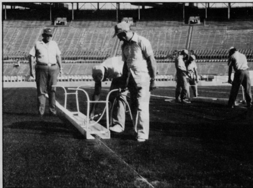
Workers mark lines on the field using templates.

been curtailed, his staff has greatly diminished. During the season or for special events, he can hire people on an hourly basis.