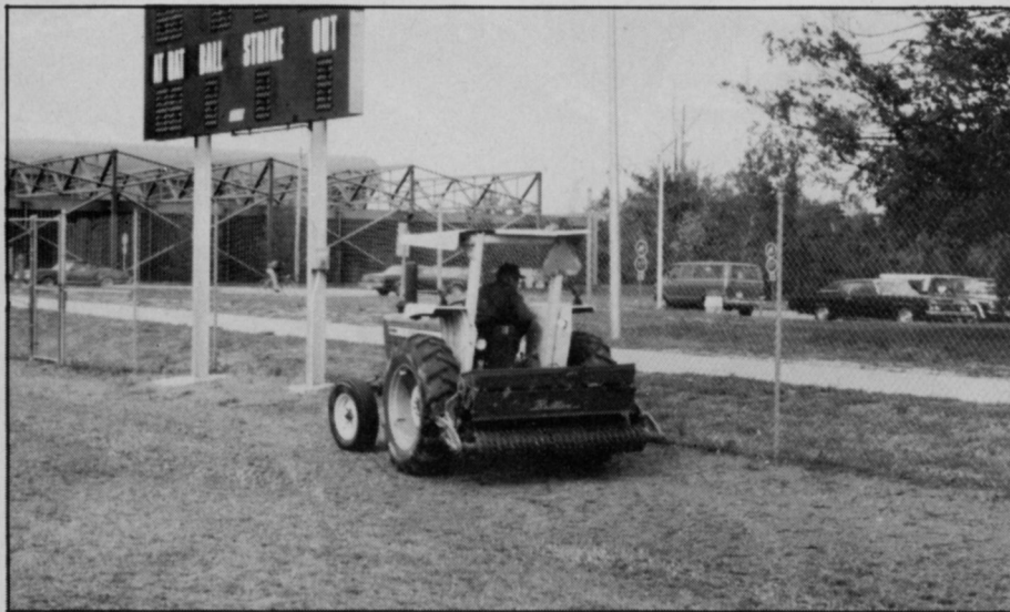
Turf Shaper was one of three implements tested for overseeding with tall fescue at 7 lbs./1000 sq. ft.

that tiling of the entire playing area may be of little value because of surface compaction which impedes water movement into the tile lines.