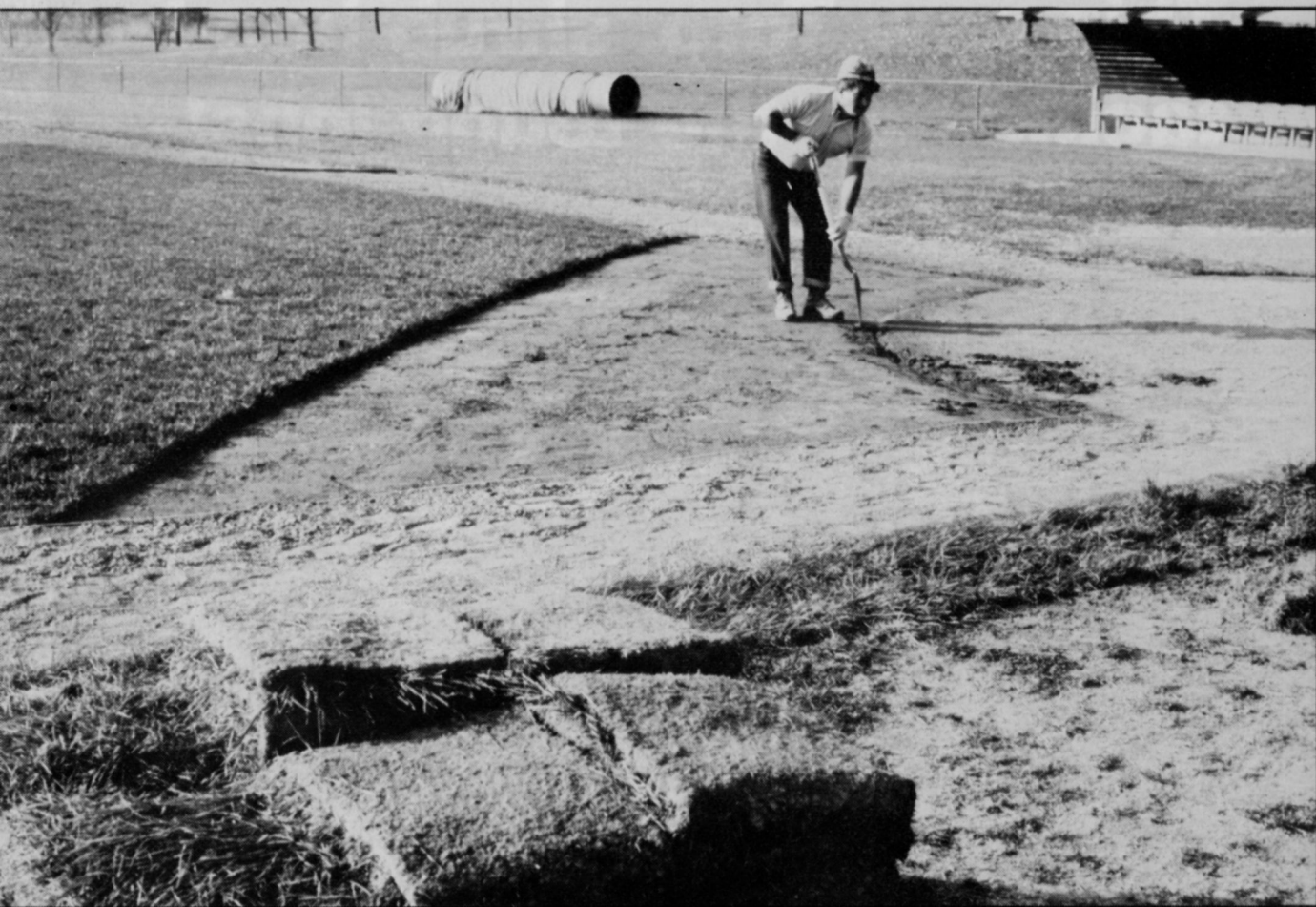
The area around home plate, the bases, and base paths present major problems due to heavy traffic.