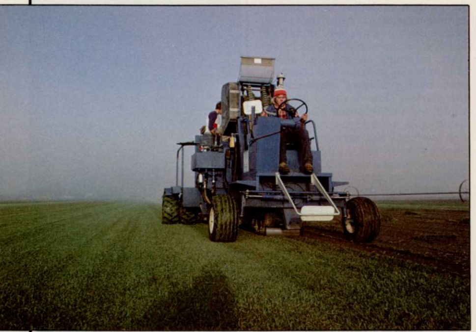
Modern sod equipment (Princeton harvester shown) increases speed and reduces handling.

"Landscape contractors and retail garden centers are our main customers, however, we do get