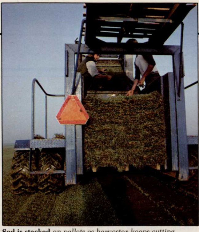
Sod is stacked on pallets as harvester keeps cutting.

"The concept of renewing a turf area is relatively new. Traditionally, people thought lawns would last a lifetime. That just isn't the case."