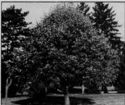
June Bride, a linden for today, see page 44