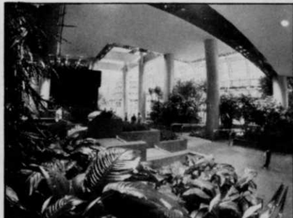
Indoor plantings have arrived, see page 24