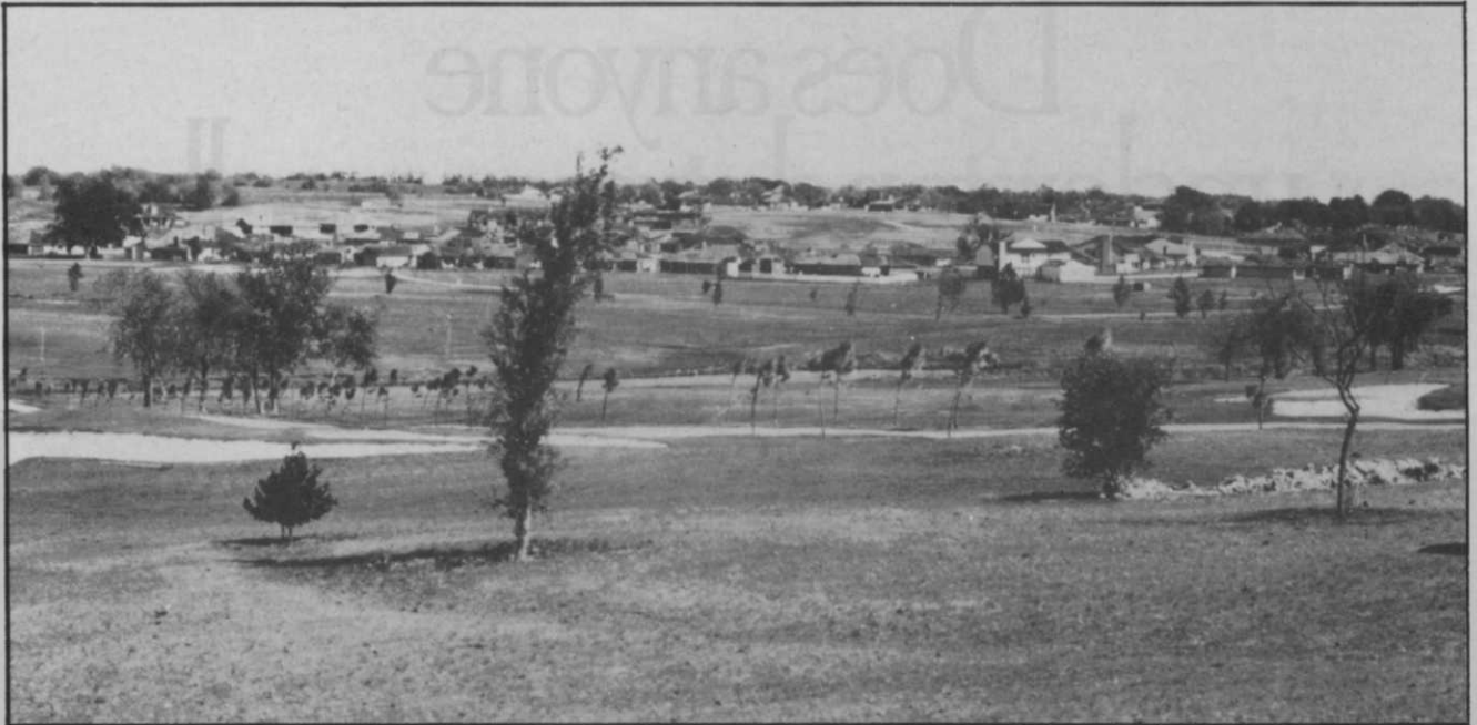
The complex of $200,000 homes abuts one edge of the course. A few of 5,000 trees planted by Hartline's crew are in the background.

eight (12 from March to November) fertilize greens and tees four to five times a year. Constant repair is needed on the turf near the cart path because of careless drivers. Weeds in the Bermudagrass greens are kept under control with Koban, usually applied five times a year.