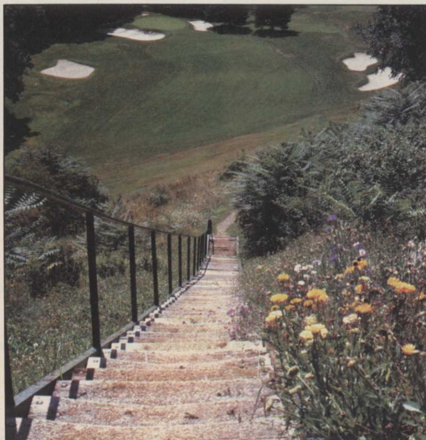
Holes like this will be preserved to maintain the historic and scenic value of the original course.