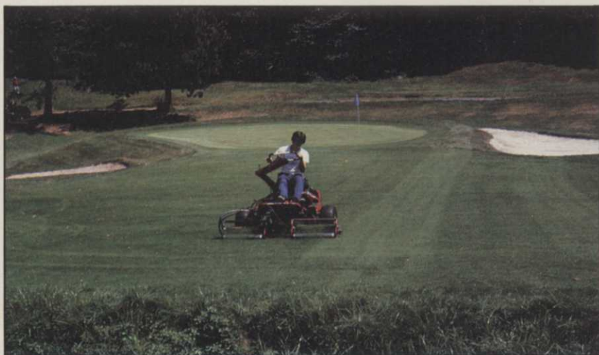
Triplex mower is much advanced compared to mowing methods when the course opened in 1888.