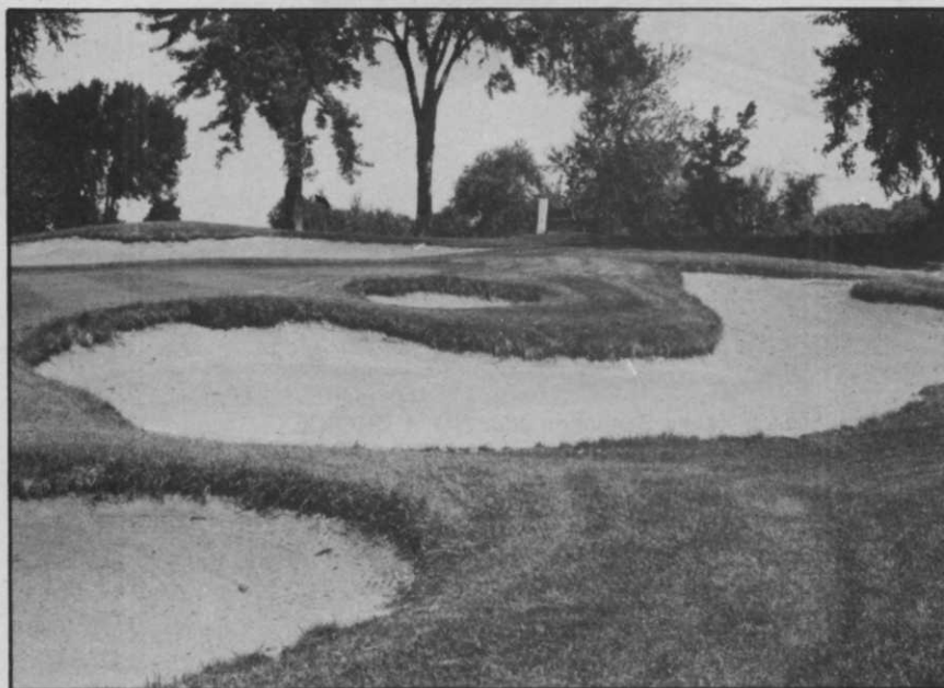
Just 4 of 118 bunkers on the two courses. Traps are edged and contoured semi-annually.