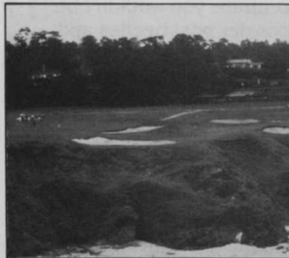
Saving the U.S. Open for Pebble Beach, see page 46