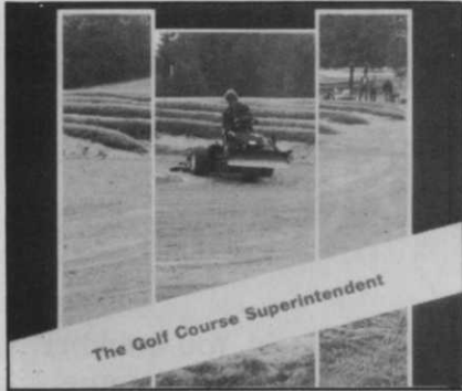
Golf course superintendent research, see page 23