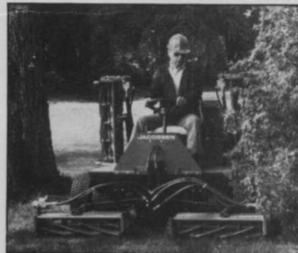
Hydraulics boost mower efficiency, see page 52