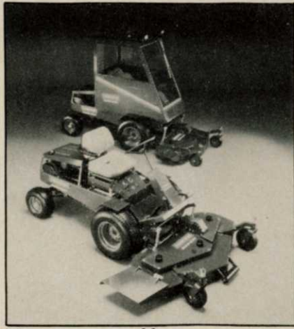
More maneuverable mowers, see page 25.

Douglas Pullman of Dow Gardens evaluates plants for success along lakes, streams, and ponds. Why manage a plant which is not suited to waterside conditions when many plants are?