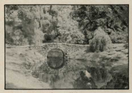
Certain trees do well by water, see page 22.