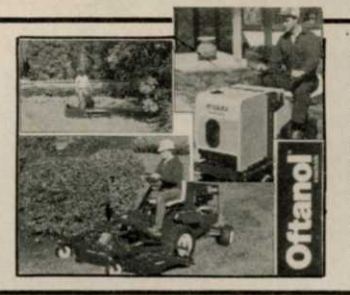
Cover: Efficiency is the driving force behind new products for 1984. Shown are Ryan's Ride-Aire, Jacobsen's walk-behind rotary, Toro's Groundsmaster, and Mobay's Oftanol.