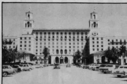
Landscape management at a Florida landmark, page 50