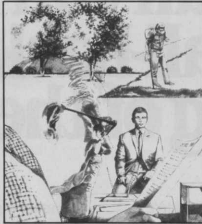
Layoffs cause hidden costs, see page 54.

Selecting, finding, and maintaining plants characteristic of many nations in the Florida climate is only one part of the Epcot Center story. Perhaps the largest landscape project in the U.S. this decade.