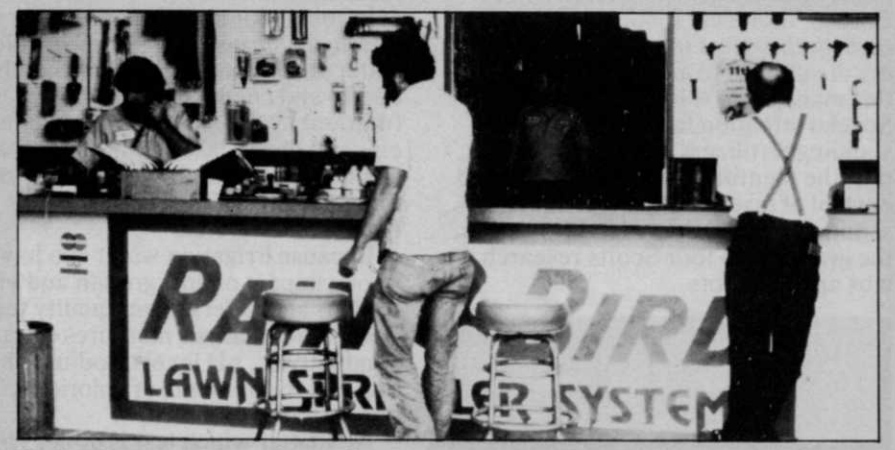
Hydro-Scape carries 16 lines of irrigation equipment, sod, chemicals, but no large landscape equipment.

A second important reason for Hydro-Scape branching out into landscape products is the dual roles of the Southern Californian landscape contractor. Many of the company's customers do both landscape contracting and irrigation contracting. "Prior to us no other distributor carried both," said Larsen. In a typical transaction, a landscape contractor might first purchase his irrigation materials, then soil amendments, fertilizer, trees, edging and sod.