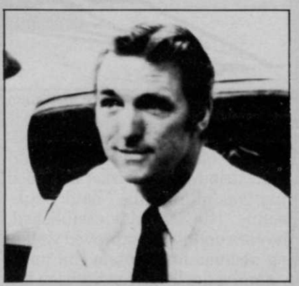
President Bruce Beckmann.

More and more landscape contractors are serviceing the industrial market," said Beckmann. "Condominiums, apartment projects and industrial complexes are being maintained more like golf courses." While 10 years ago it was accepted that turfgrass had dormant periods, today turf is expected to be maintained 12 months a year.