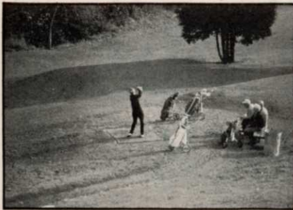
Fight compaction problems on tees, see page 24.