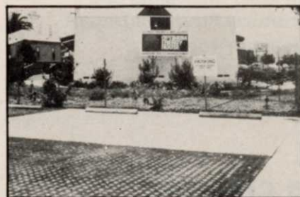
Turf block parking lot in LA, see page 45.

An improving economy may help out seed growers who experienced good seed harvests this summer despite lagging demand. Harvest results by variety are listed and company spokesmen give their opinions on the seed situation.