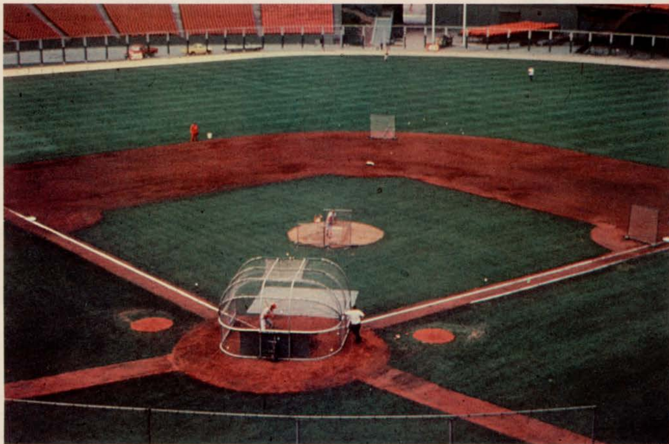
Candlestick Park's natural field in 1980. Kezar Stadium (inset), the predecessor to Candlestick.

During the National Football League playoff games in January, the media cursed and praised the natural grass playing surface in San Francisco's Candlestick Park. Controversy is not new to Bay Area playing surfaces for back in the days when the San Francisco Forty Niners played their home games in old Kezar Stadium, the turf or absence thereof, was cursed and discussed. Kezar Stadium, a city owned facility, has traditionally been plagued with over-use problems since it is used by colleges and high schools for athletic events.