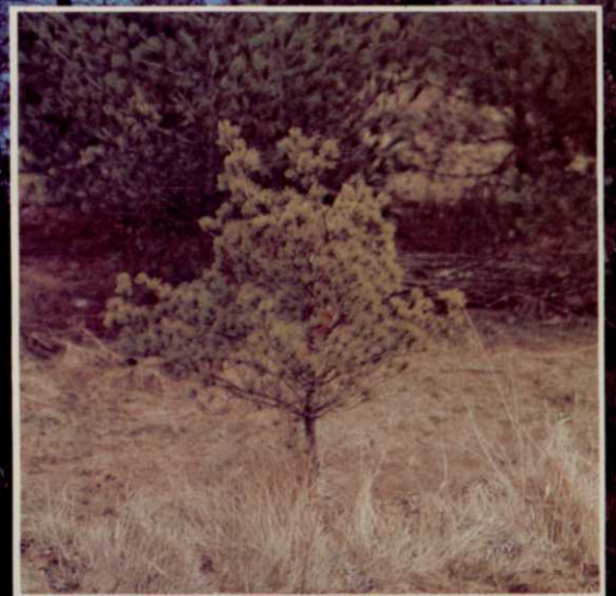
Typical chlorotic dwarf individuals of eastern white pine.

Thin crown and chlorotic foliage of this ponderosa pine in the San Bernardino Mountains identify it as more ozone sensitive than the more tolerant ponderosa pine on the left.