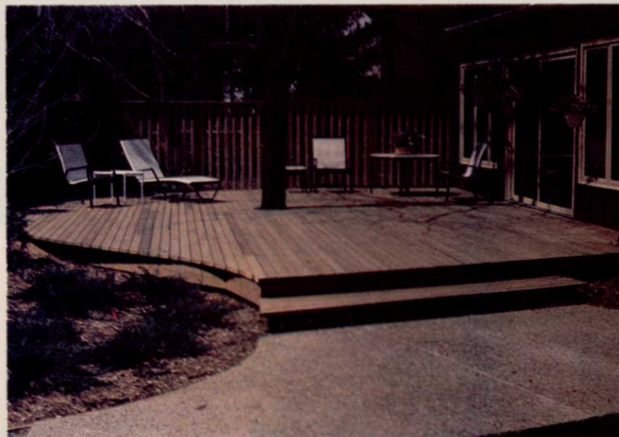
Piano-shaped deck is set on I-beams in a cement base. Doerler Landscaping used this method instead of the wooden joist arrangement due to insufficient depth.

High interest rates. Reaganomics. Tight money. While these terms often herald bad times for the new construction market, many landscape contractors have found their deck construction business on the upswing.