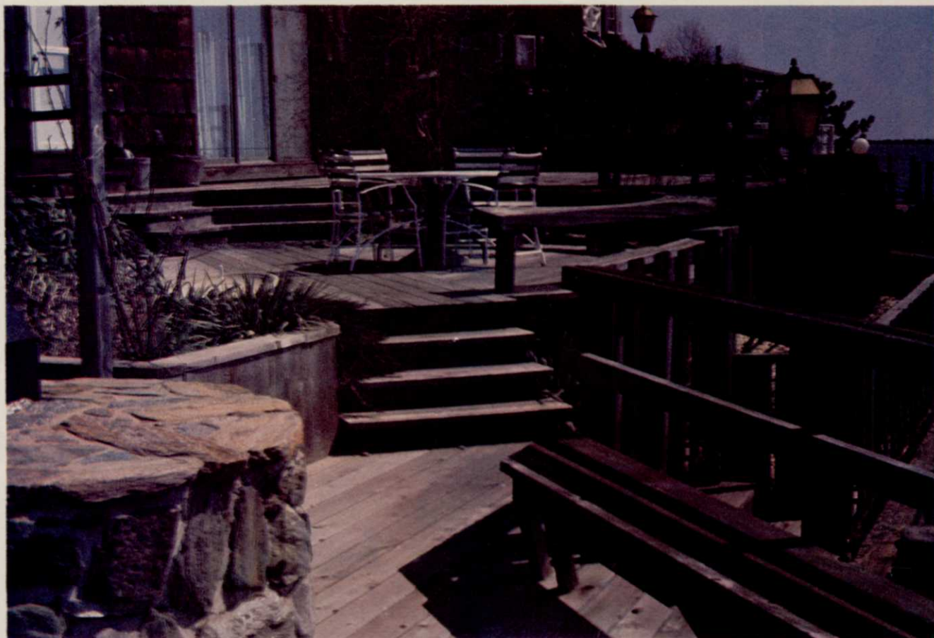
Planking designed to steer people from one area to another is the trademark of a Ridge Nurseries deck.