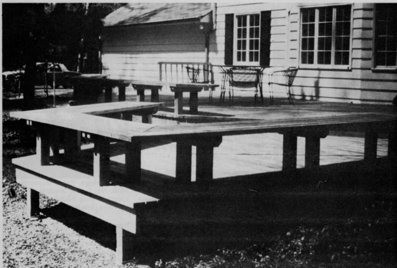
Bracing of the bench to the deck is one of the many areas that lend itself to innovative and unique designs.