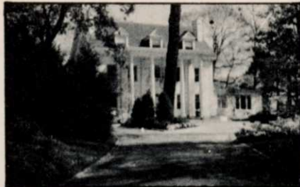
Deriving new business from old landscapes, page 28.

Doug Chapman covers a number of Ilex species for urban tolerance, foliage, fruit, and management. The shrub forms of Ilex have a wide range and offer diversity to landscape designers.