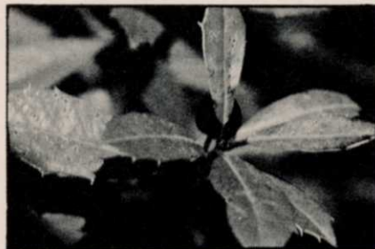
Fruit and foliage in urban conditions, Ilex, page 38.

WTT selected landscape renovations projects from this year's award winners to show that new construction isn't the only game in town. Judges provide their reasoning for selecting this year's winners.