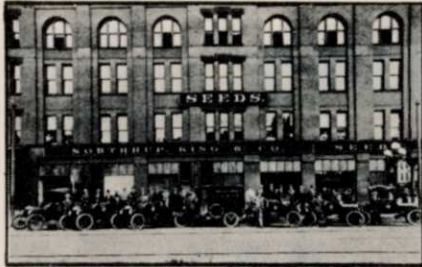
Northrup King's sales forces nearly a century ago, page 18.