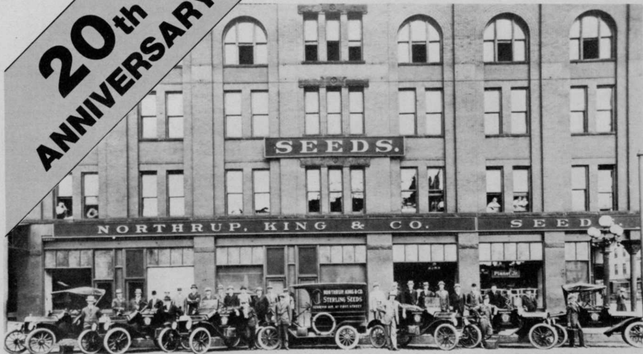
In 1915, agriculture and turfgrass seed salesmen proudly stand by their Fords.