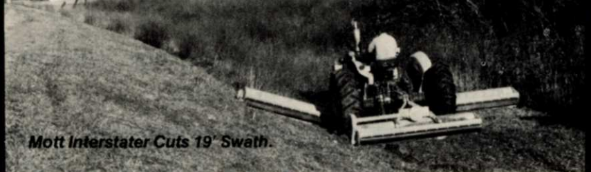
Mott Interstater Cuts 19' Swath.