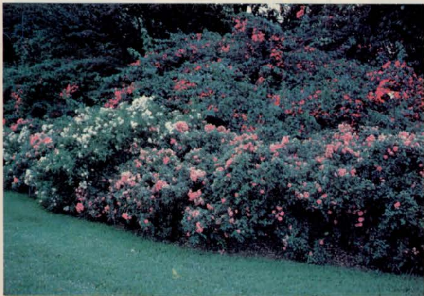
Hedge of China Doll at Cypress Gardens, FL.