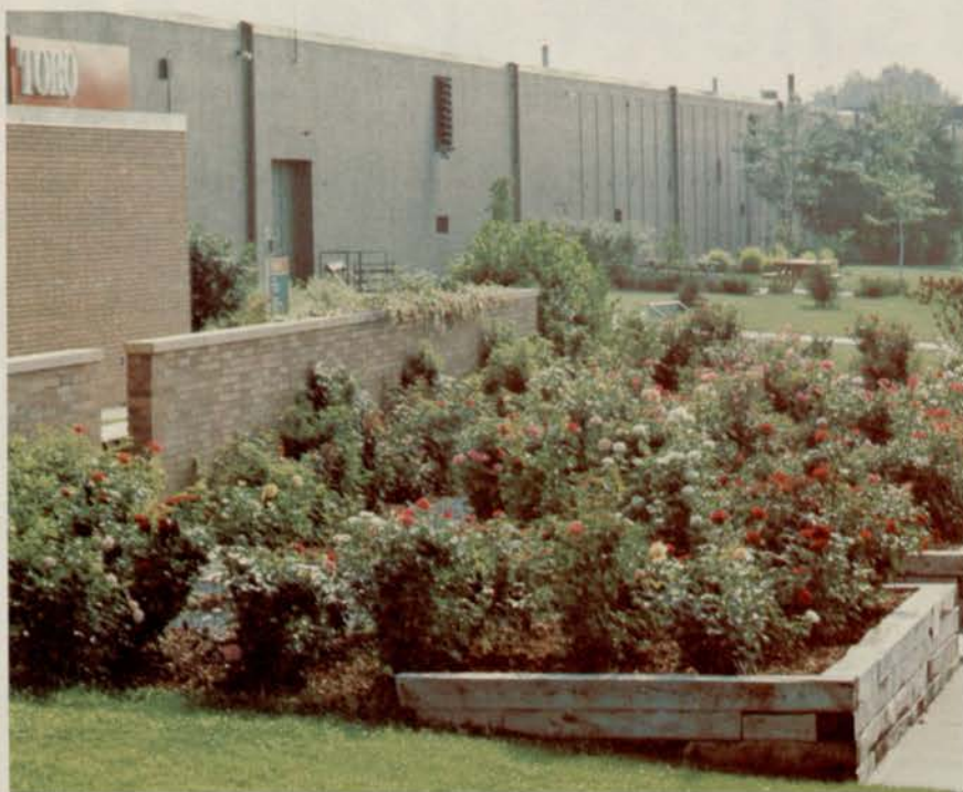
Rose planting at the Toro Co., Minneapolis, MN.

or polyantha roses make excellent hedges and can be used along property lines to hide fences or be "living" fences themselves. "The Fairy" and "Betty Prior" are good variety choices for this use, as is "China Doll", so dramatically used in Cypress Gardens, FL. It grows so thick that no man, child, animal or vehicle could or would want to fight the thorns to get through it. Pruning needs are minimal and can be achieved with hedge clippers if desired.