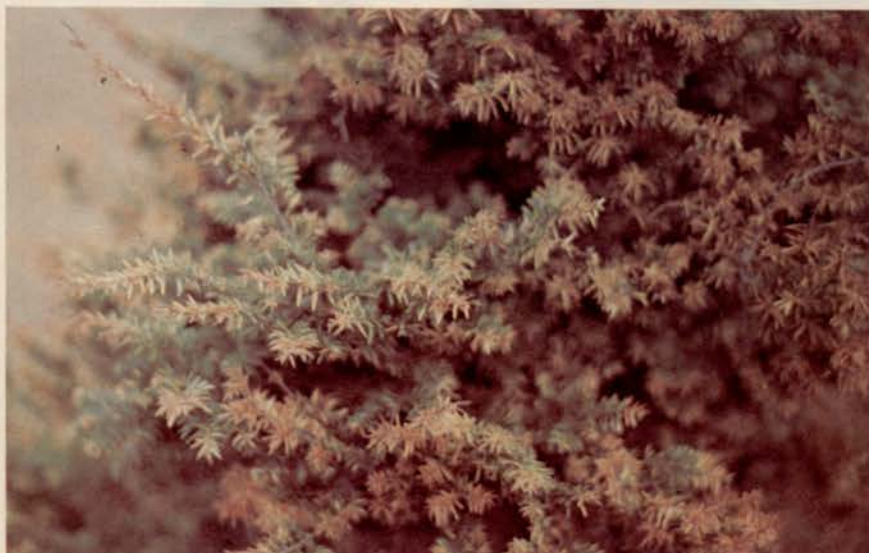
Salt spray damage to eastern hemlock growing near highway.

Hydrogen fluoride is a pollutant of localized nature, primarily