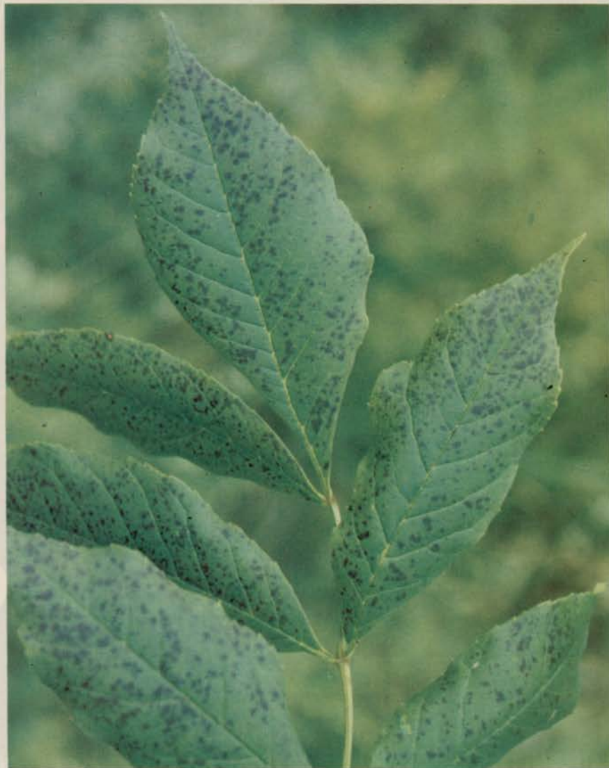
Injury to green ash caused by ambient ozone pollution.