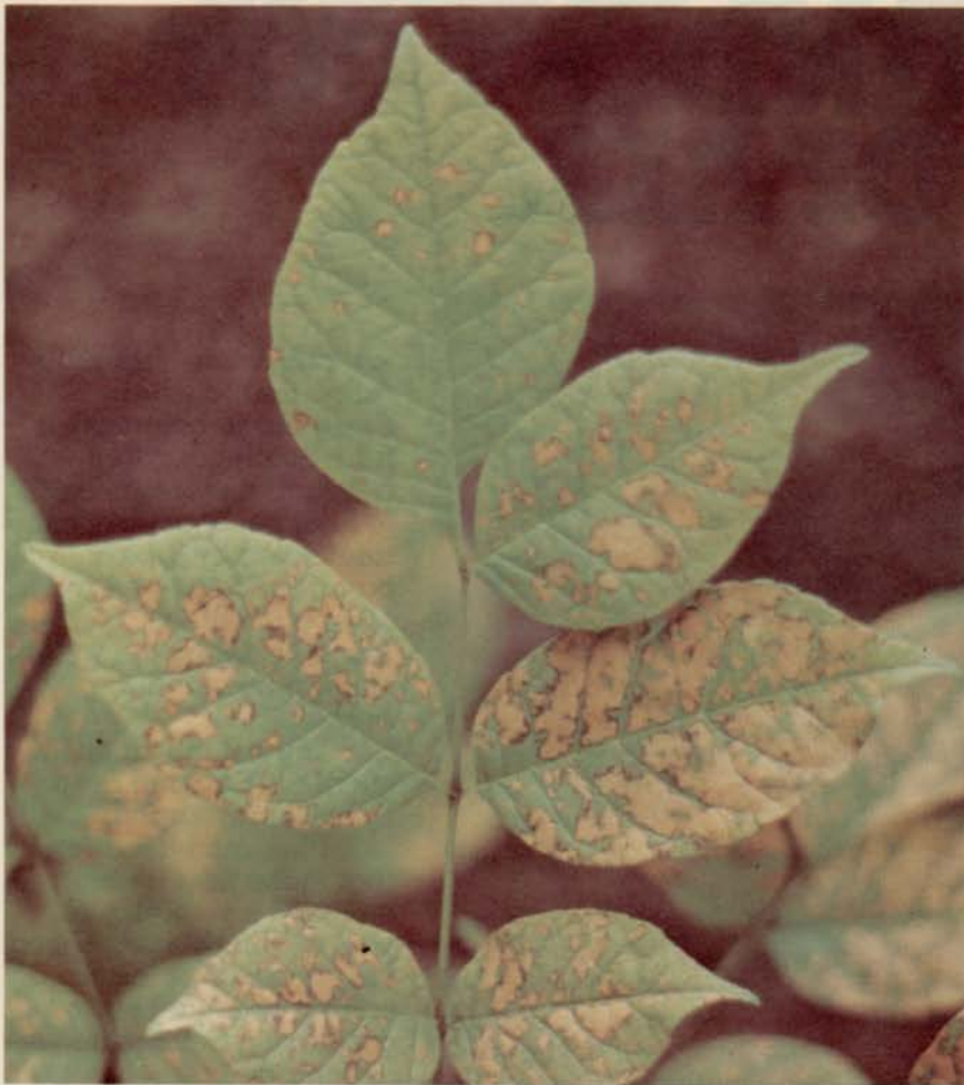
Sulfur dioxide injury to white ash following a fumigation with one ppm for 7½ hours.

much of the eastern half of the United States. From the authors' experience in the Midwest and Northeast, the most common air pollution injury to shade trees during the past five years has been