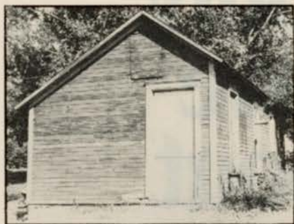
Early turf equipment plant, page 18.