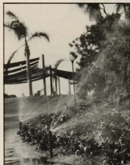
Overhead irrigation can be wasteful, page 24.