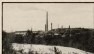
Cover: Air pollutants may be the cause of tree problems today. Arborists should know and understand the symptoms of pollution stress.