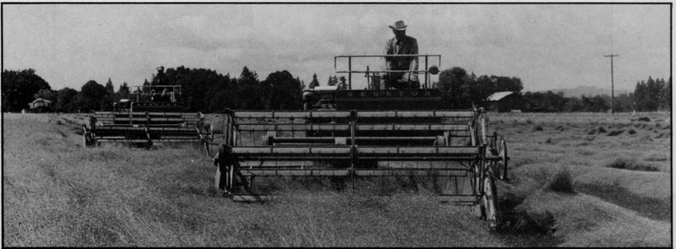
Commercial production of improved turfgrasses took hold in the Northwest in the 60's.