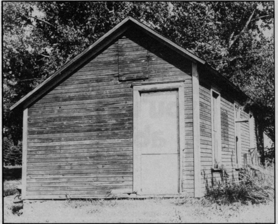
The first location of K&N Machine works, later to be Ryan, of OMC Lincoln.