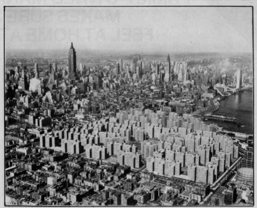
Overhead view of Peter Cooper Village and Stuyvesant Town.