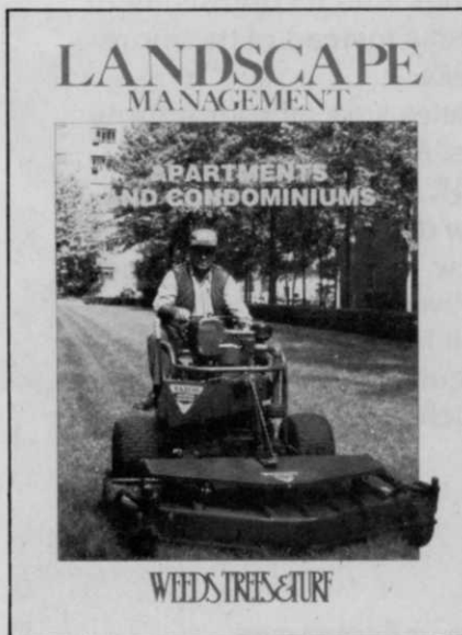
Curb appeal for apartments, see page 29.

Keep this page for quick reference to articles during the past year. Saves time and helps you find valuable references quickly.