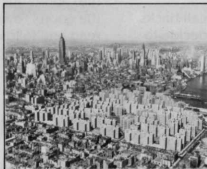
Eighty acre oasis in N.Y.C., see page 32.