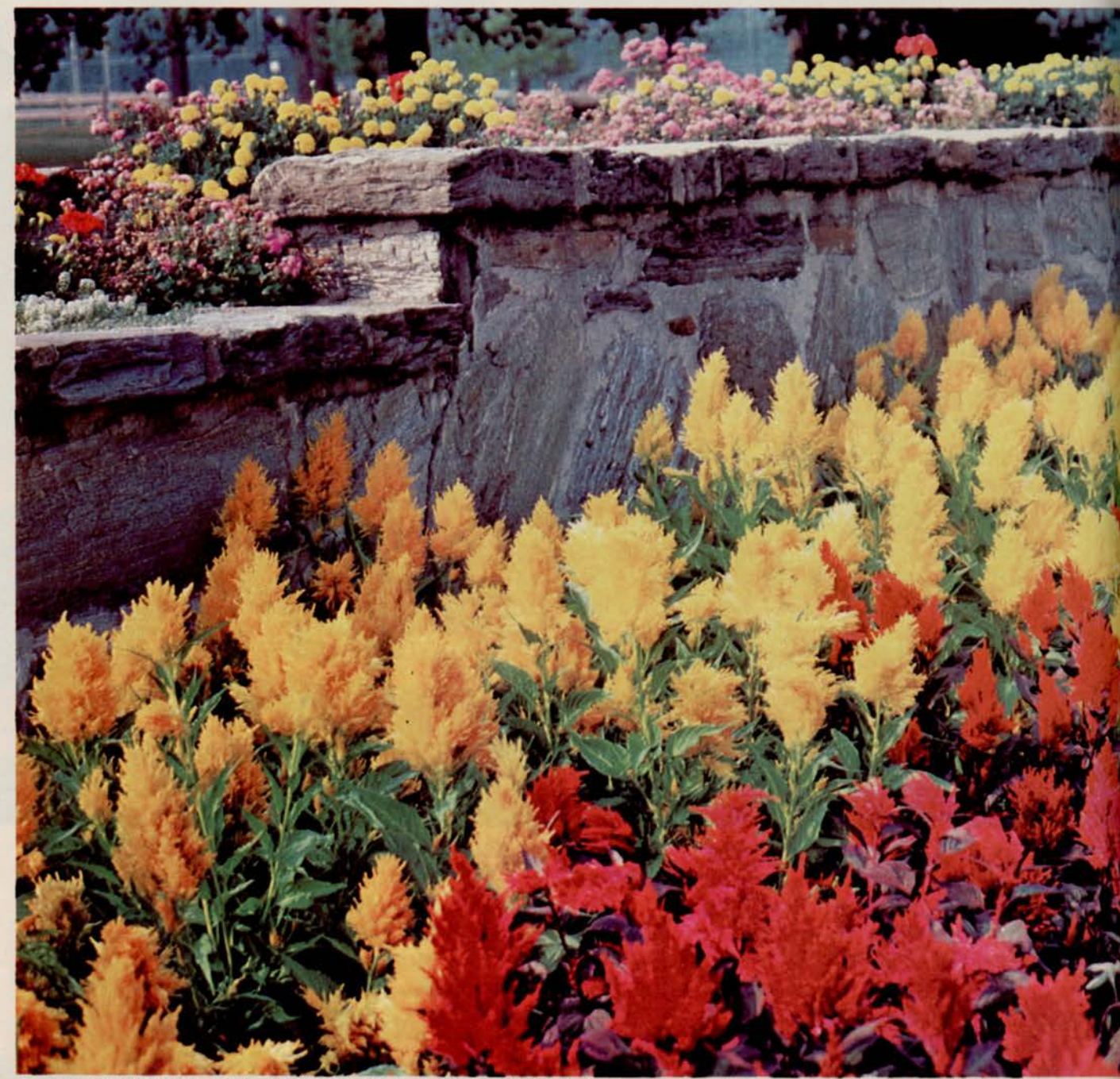
Celosia (pictured above) adds a burst of color to this bed at Mt. Airy in the Pennsylvania Poconos. Ageratum (right) is known for ease of maintenance and will bloom non-stop without having its faded flowers removed.

there is no irrigation system to work with, annuals can still color up the landscape provided you choose the right types. For a touch of blue in a low growing plant suitable for massed beds, rock gardens or as an edging to larger plants, select the tiny and fluffy-flowered ageratum. One of the best annuals for ease of