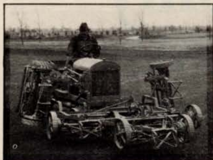
Toro, circa 1929. P. 20.