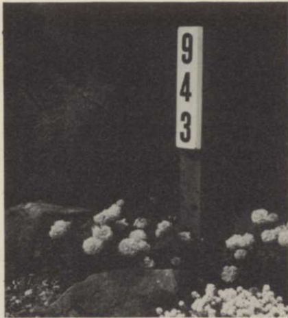
Keys to landscape photography.