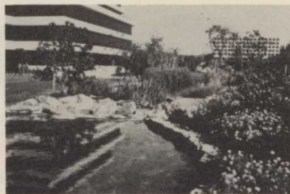
Award winning Marriott headquarters.