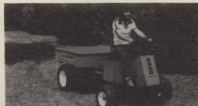
Knowledge of vehicle's limitations can stretch use.

Golf courses struggle to get more than four years out of a golf car fleet. Time is running out on many courses in the U.S.