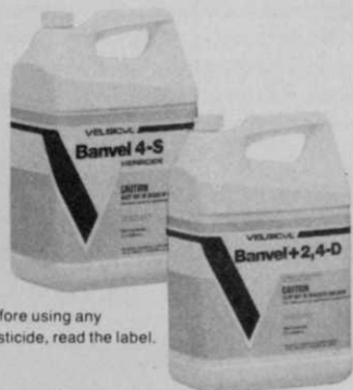
Before using any pesticide, read the label.

Ask your Velsicol distributor about BANVEL 4S, too. Or write Velsicol Chemical Corporation, 341 E. Ohio Street, Chicago, IL 60611.