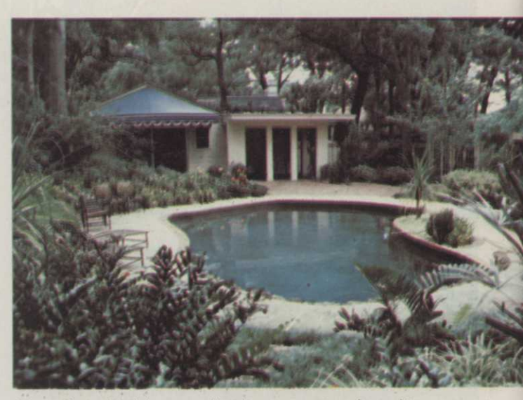
Chazz Cox —Both house and landscape were transformed to make an older home and lot more entertaining and tropical. There is no grass on the project. Pool was also added.

Book Sales One East First Street, Duluth, MN. 55802 (Add $2.50 per Binder Shipping Chg.) Allow 6-8 Weeks Delivery.