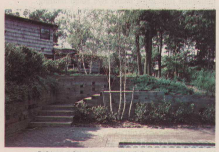
Dubner — Steep lot presented challenges of a pool and low maintenance material.

The interior of the house is very contemporary and the design of the landscape had to fit this. All the natural tones of the floor and inside of the house were matched through brick pavers and wood decking outside.