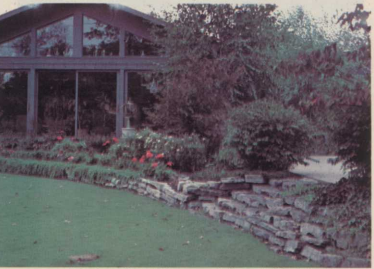
Bunch — Naturalistic approach for a plant loving customer. Carefully planned selection provides multi-season attraction.

Harold Timmer of Bunch selected small flowering trees and dwarf forms, such as maples, to get a quantity of materials and keep them within the scale of the property. He worked in a few large trees as pivotal points and an undergrowth of hawthorns, redbuds, Amur Maples, dogwood, sourwood, Amelanchier, and small flowering crabs. Ground covers were also used as well as some shrubs and small evergreens to provide shape in the planting designs.