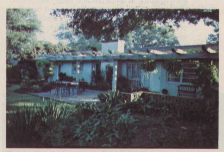
Vista — New touches for an older site gives larger appearance.

This site is a good example of the introduction of new materials into an established surround-