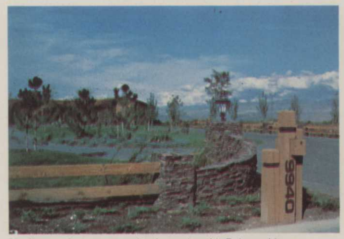
Sterling — Compartmentalization makes this Boise residence an entertaining setting.

Sterling built up and established a back yard with fill and topsoil. An area for entertainment was designed and constructed along with a smaller patio area and a patio outside the master bedroom. By use of paths that were heavily surrounded with plants, the designer created small areas for different purposes. "Compartmentalization of all the spaces made it exciting," says John Sterling. "People experienced different spaces like they were walking into rooms."