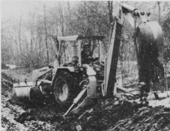
Winter work can be stunted and halted if equipment has not been checked and properly maintained.

Other major components of the machine must be ready to function in the cold temperatures as well as the engine. Here are some suggestions for winterizing these other systems.