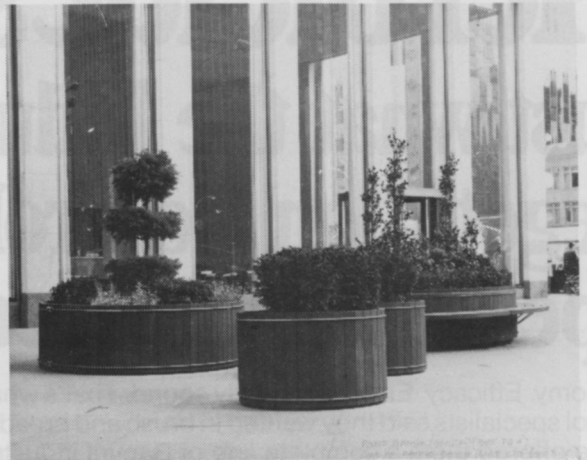
Rosenwach's redwood round planter and circular planter-bench are available in custom sizes. The planter has two-inch-thick staves and galvanized steel hoops.

All-heart California redwood is the material used in Rosenwach's (301) Sitecraft benches and matching planters and litter receptacles. The backless Parker bench is set on wood pedestals and made of border members dressed 1 \frac{3}{4} " x 5 \frac{1}{2} " and inner members nominal 2" x 4". A sculptured contour bench is set on a steel pedestal and comes in lengths to 84 inches. Planter benches are available also, in rectangular, square, and circular shapes. Standard rectangular and square benches are 18 inches wide and fastened by thru-bolted steel brackets.