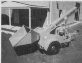
New and used Asplundh Chippers 12 and 16-inch gas or diesel. Most models in stock. Will buy, sell, or trade.

Other trucks in stock: (6) 4-5yd Ford Chevrolet Dumps V/8's etc. $2000 to $7000 (4) Stokes 12 to 18 ft. Gas or Diesel $2500 to $7000.