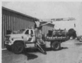
(2) 1973 GMC 6500 Dumps w/reach all hyd crane. V/85 sp. $4500 each. (2) 1973 Ford F750 V/85 sp. w/reach all hyd crane. $4500 each.