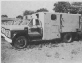
(28) 1968-72 GMC 5500 series with crew cabs and dump chip boxes. Running condition but all need repairs. $1200 to $2200.