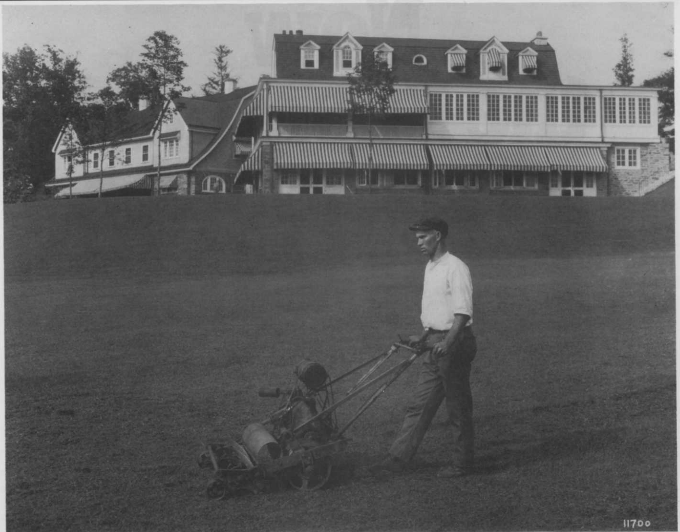
Early gasoline-powered single reel mower. Circa 1920.