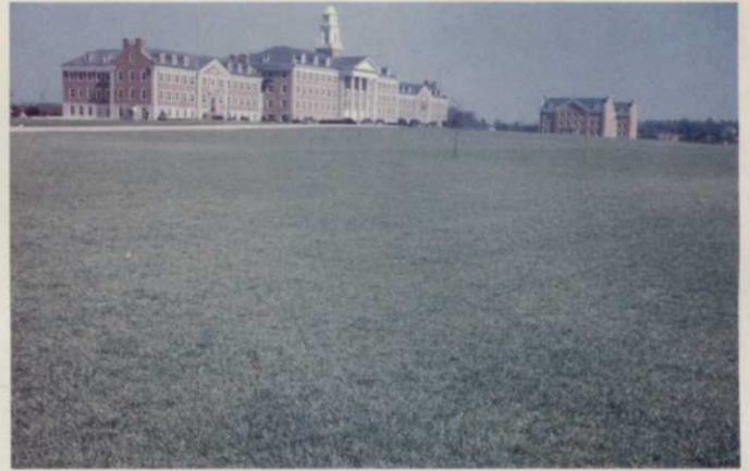
Arlington Turf Gardens prior to the construction of the Pentagon (left). Turf plot in front of administration building at Beltsville, MD. (right).

vice in 1936, the government bought up the excess seed and distributed it across the United States in carloads. As late as 1946, there were farmers who had picked up carloads of surplus seed in 1936 and were still trying to sell it to seed companies."