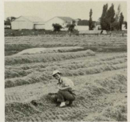
Green seed windrowed in curing yard in the Midwest during common bluegrass production.

• local seed store selling garden, agricultural and grass seed to a community. Some of these include Adikes (1855), Northrup King (1884),