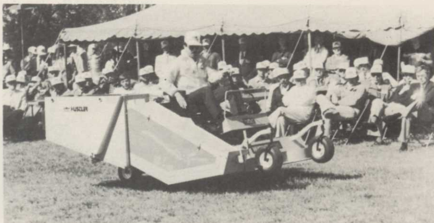
The first ride on the Excel 261 mower occurred this May at the company's Optimistic Day in Hesston, KS. About 350 people attended the plant tours and equipment demonstrations. The 261 sports a three-way deck with side discharge, rear discharge, and mulching modes.

Nursery growers may apply for disaster loans from the Farmers Home Administration or Small Business Administration (either, not both). Landscape and retail firms should apply to SBA. The area must be declared a disaster area to receive federal assistance.