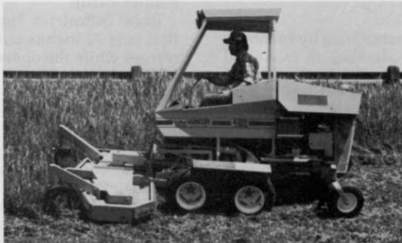
Hustler highway rotary mower. Log fork from Tube-Lok Products.

Log forks are constructed of high-strength alloy steel, with extra large heat-treated pins and hardened steel bushings. Wear bars are hard faced to extend tine life. The spacing of fork cross-members gives the operator good visibility for productivity and safety. (Circle 224 on free information card).