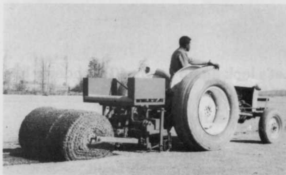
Big Roll Harvester

A unique answer to the sod harvesting and handling situation is Beck's Big Roll. This system harvests three 16-inch rolls of sod simultaneously and can lay them the same way. The sod is rolled onto cores which are handled by a carpet pole like device. This core permits handling by cranes and adapted forklifts. It also permits laying with a tractor three rolls at a time.