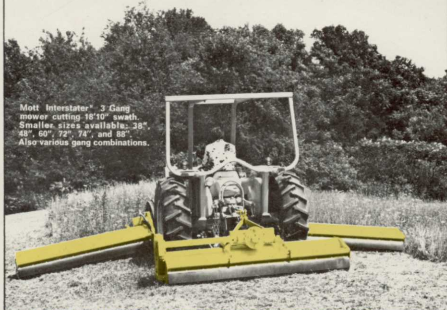
Mott Interstater® 3 Gang mower cutting 18"10" swath. Smaller sizes available: 38", 48", 60", 72", 74", and 88". Also various gang combinations.

Write or call for information about YOUR MOWING REQUIREMENTS. Mow flail safe... with Mott Mowers.