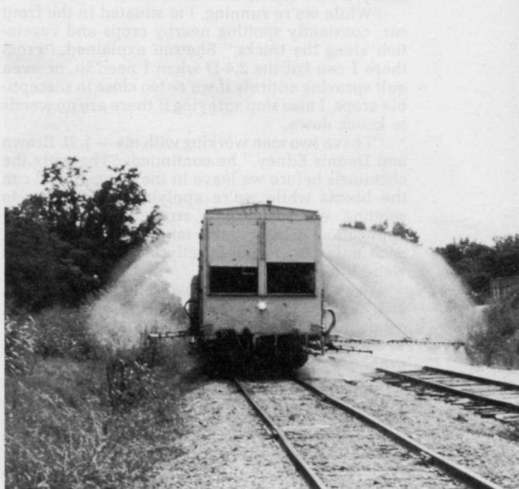
Shetron's crew was on the road for 165 days in 1977. In good weather, they run seven days a week, 15 hours a day. Their goal is 125 miles of track per day.

According to Bogle Service Engineer Red Shetron, their spray crews avoid crop damage by altering the herbicide spray pattern when necessary. For example, Shetron and his crew frequently spray a mixture of Ortho Paraquat CL and Karmex 80W from one set of booms, and from a second set they apply a mixture containing 2,4-D. When the train is within close range of a farm field, how-