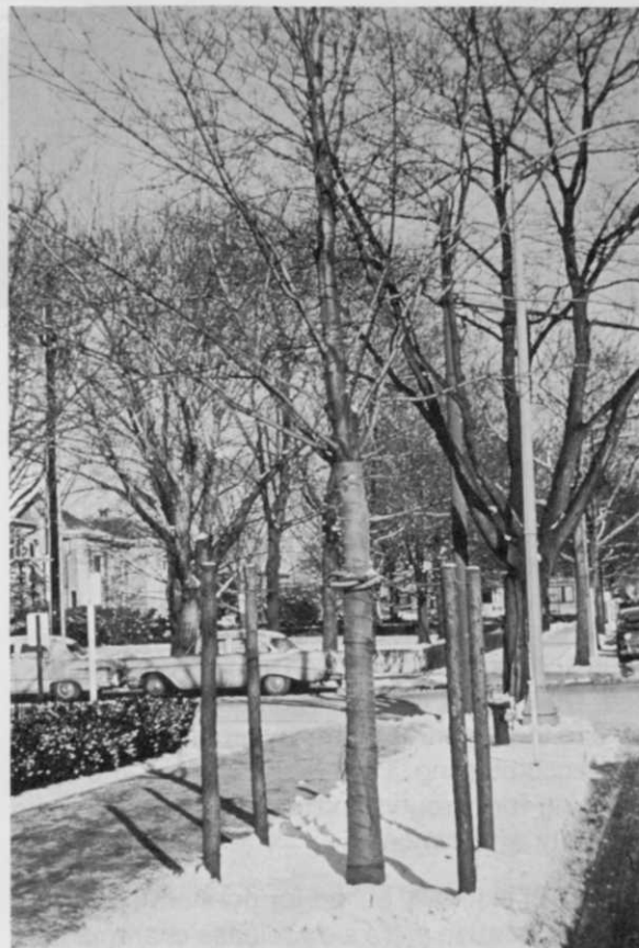
Newly planted tree is staked and wrapped in preparation for the winter.