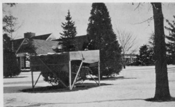
Burlap is placed on top and around wooden frame for protection.