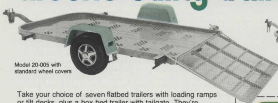
Model 20-005 with standard wheel covers