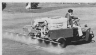
TL10 and 40 Series