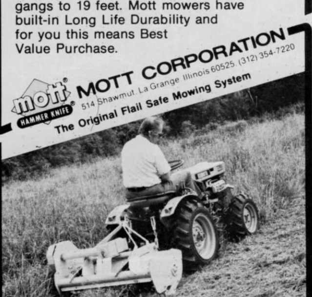
Circle 109 on free information card

Cutting widths from 38 to 88 inches and gangs to 19 feet. Mott mowers have